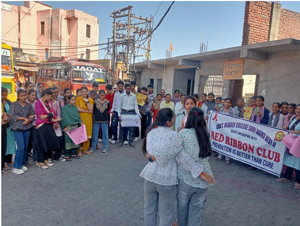
Reaching out to the community by presenting skit in the bus stand of Naina Devi Ji